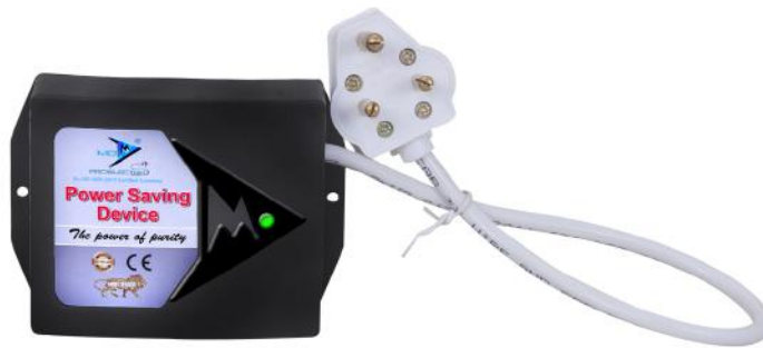
MD Proelectra -Power Saving Device