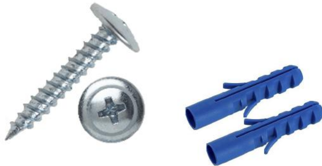
Screw & Screw wall Plug For Power saing device fitting